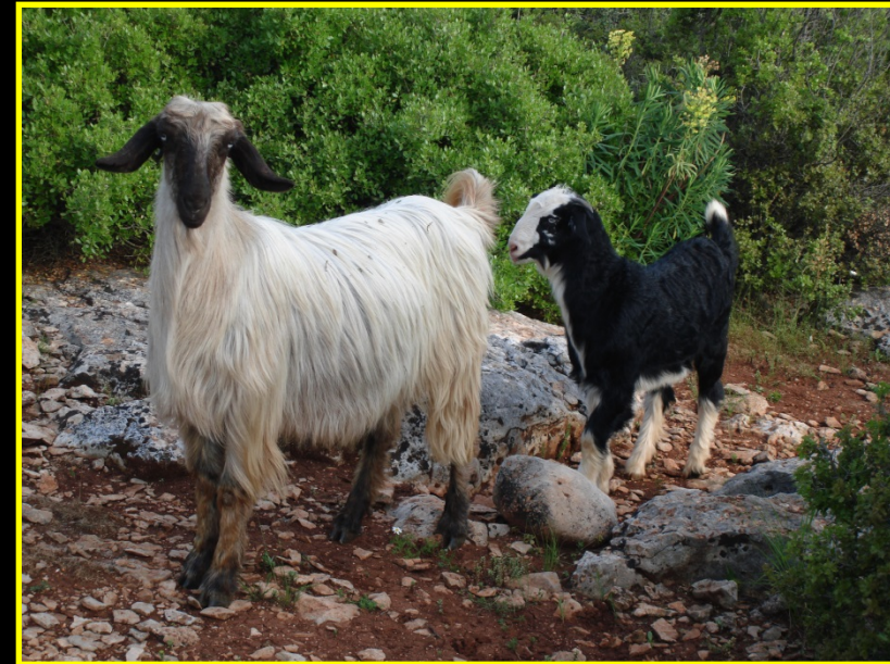
Honamli Kids in KONYA