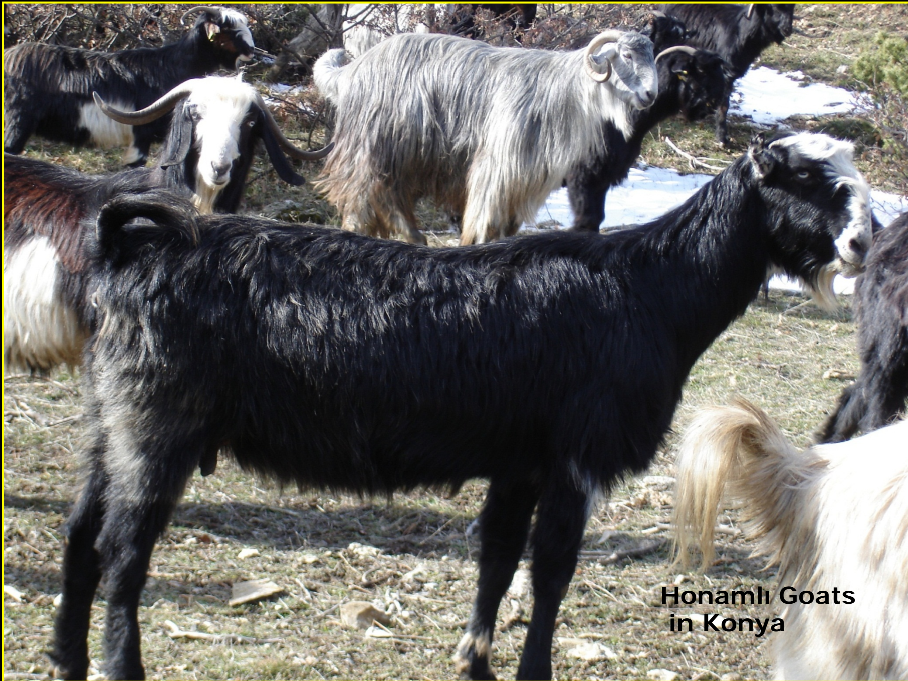
Honamli Goats in Konya