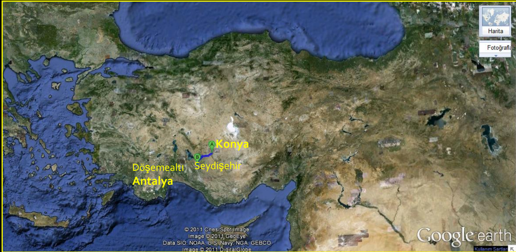
Konya and Antalya Provinces in map