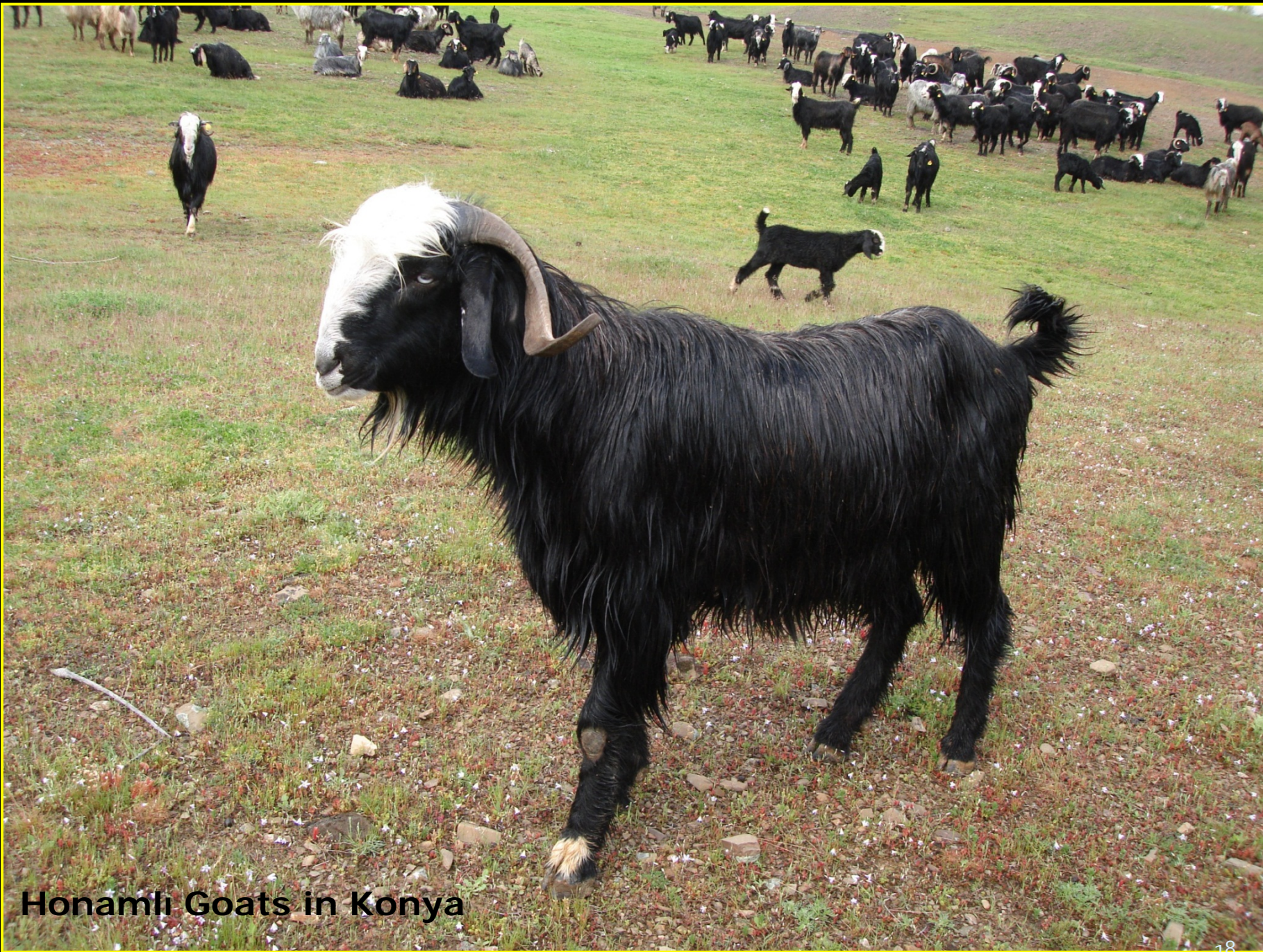
Honamli Goats in Konya