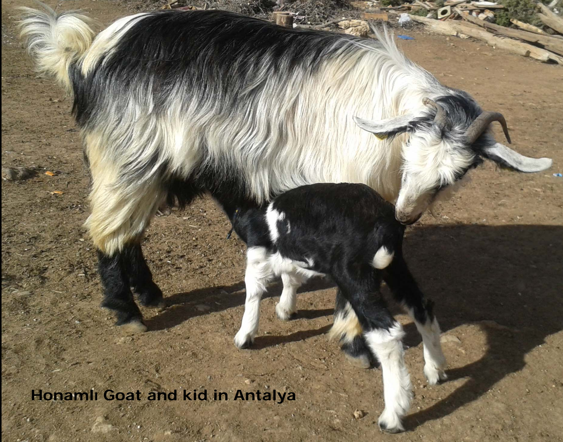
Honamlı Goat and kid in Antalya