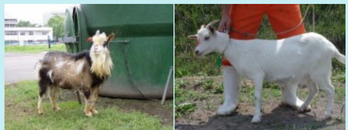
Japanese indigenous goats

The Japan Goat Network is holding its 20 years anniversary of annual summit from October 13 - 14, 2018 in Ibaragi Prefecture. The organizers are planning to make this event very special for members that includes producers, researchers, consumers, and goat lovers as well as national and international guests. The IGA Japan will also take part in the program. More information can be found at: < http://japan.goat.web.fc2.com >